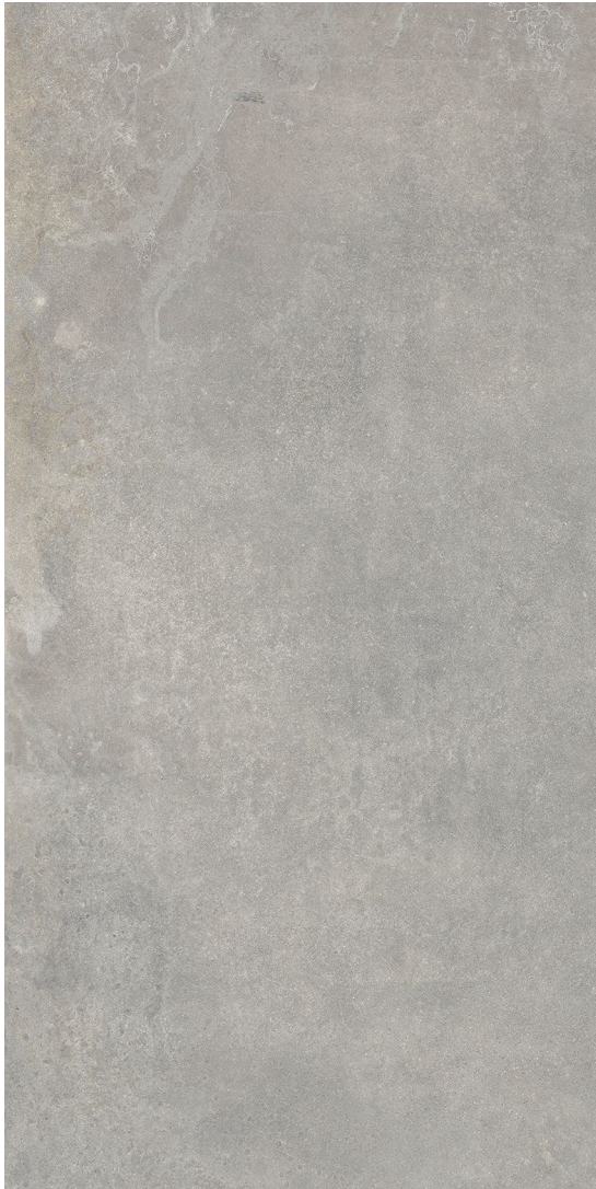
URBAN (Light Grey) Matte Finish; Thickness 9 mm 30 x 60 cm (12" x 24") BC.BL.URB.1224 60 x 60 cm (24" x 24") BC.BL.URB.2424 80 x 80 cm (31.5" x 31.5") BC.BL.URB.3232