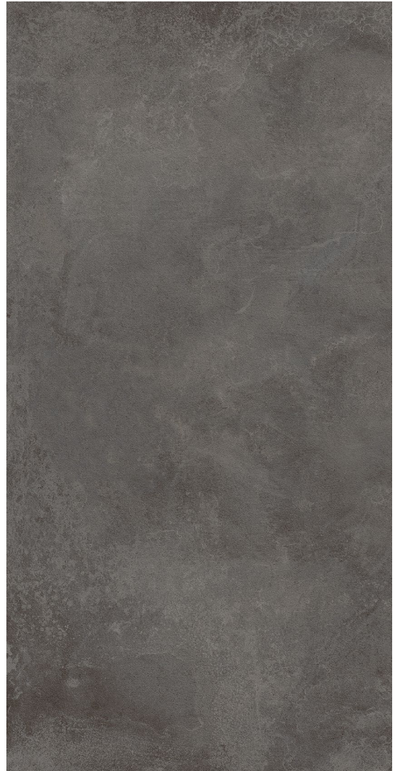
MASTER (Dark Grey) Matte Finish; Thickness 9 mm 30 x 60 cm (12" x 24") BC.BL.MAS.1224 60 x 60 cm (24" x 24") BC.BL.MAS.2424 80 x 80 cm (31.5" x 31.5") BC.BL.MAS.3232

All items shown in this document are part of Olympia's stocking program. For special orders, please contact your Olympia Tile Sales Representative.